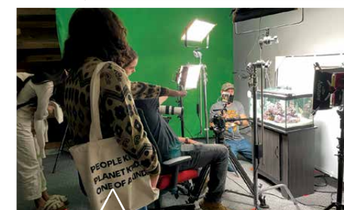
Students learn about the production aspects of Brave Wilderness.

Coyote Peterson is an Ohio State graduate who built his own interdisciplinary major in Film Production while in school. He is now the host of the Brave Wilderness YouTube Channel, where he shares educational and engaging programming about animals and conservation. His message has really struck a chord with his audience — Brave Wilderness reached 20 million subscribers on YouTube this year, and Peterson was recently nominated for an Emmy Award for his work as host of the channel. ■