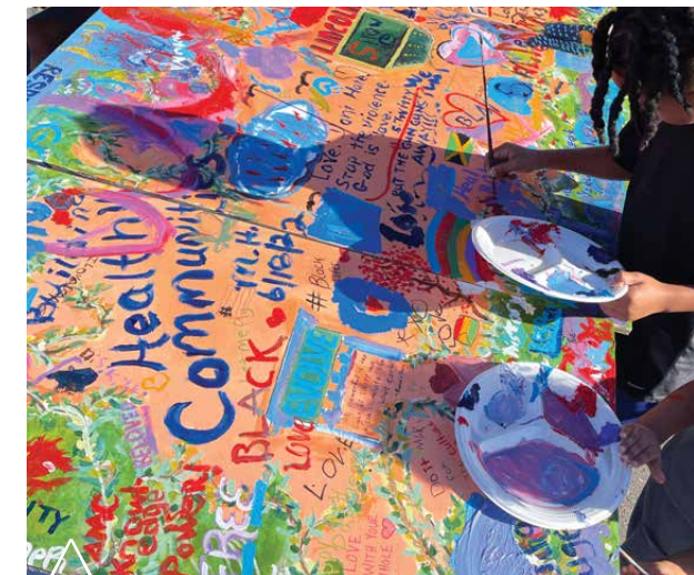
Close-up of community mural which now lives at the Ohio State African American Community Extension Center in the historic Bronzeville neighborhood.