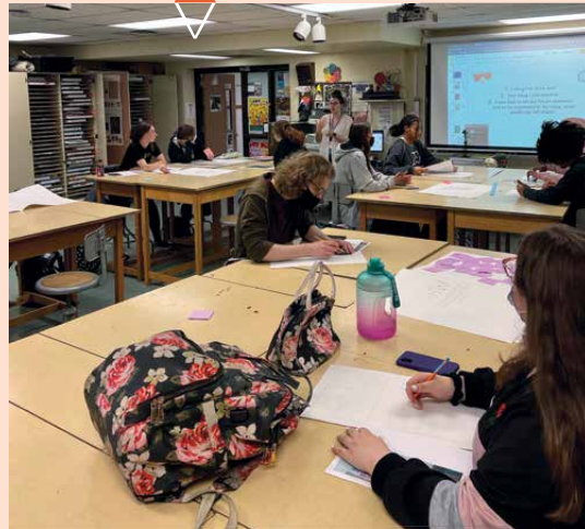
Advocate: Students brainstorm for ways to advocate for art in their schools and broader community.