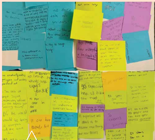
Anticipate: Student responses to discussion prompts about the future of art and society and the role of creativity in their lives.