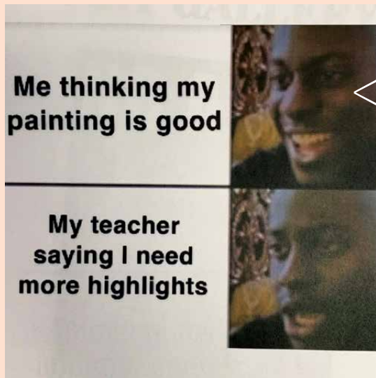
Advertise: Students created memes to grab viewer attention and advertise the digital art show.