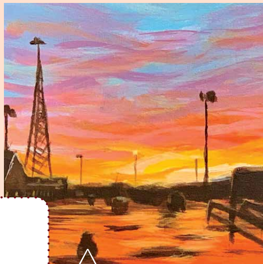
Appreciate: An example of peer work in a student art show.