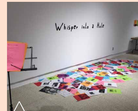
Upon entering the gallery, visitors were met with a score created by the curators and previous posts from the Minus Plato blog.