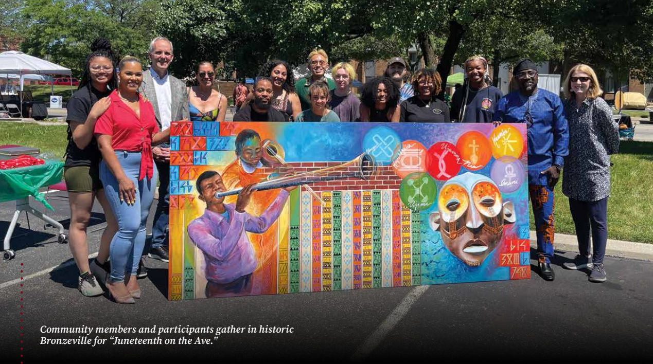
Community members and participants gather in historic Bronzeville for “Juneteenth on the Ave.”