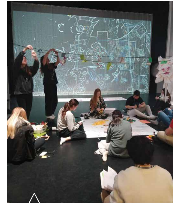
Students engaging collectively within the ACCAD motion lab.

The motion lab visits were designed as three distinct but connected experiences: 1) an introduction to the lab and possibilities with movement, space, lighting, live-feed projection, and sound, 2) an instructor-designed experience which immersed students in reflection and envisioning through drawing, observation, and interaction, and 3) a culminating experience that was student-designed and built on their previous two experiences within the space. As students began to design the third experience in the motion lab, they worked together to design structures and prompts promoting collaboration and reflection. They used motion lab floorplans, reflective videos, and discussion groups to share and make decisions about the atmosphere and structure of the experience. Ultimately, students installed four artmaking stations in the motion lab that encouraged play, reflection, collaboration, and openness to experimentation. They documented their experiences through visual journaling, open dialogue and use of a live capture video projection. Classroom experiences encourage connection, dialogue, reflection and engage multiple senses. ■