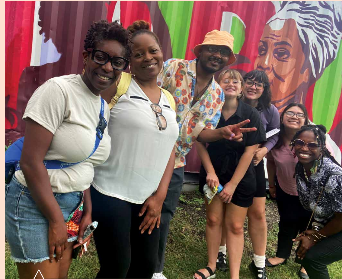
Maroon Arts leaders gave Barnett Fellows and a visiting prospective student a tour of their performance and exhibition space located on Mt. Vernon Ave. in Columbus' historic Bronzeville district.